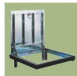
FLOOR ACCESS DOORS