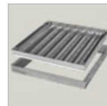
FLOOR ACCESS COVERS

To arrange a CPD Seminar at your premises please call: