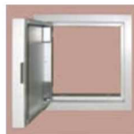
WALL AND CEILING ACCESS