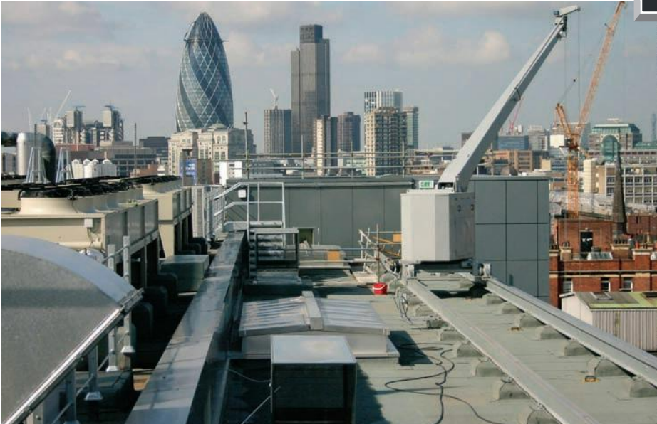
A Bilco Type D-50 aluminum roof access hatch can be seen in the mid-ground on the roof of the new Pathology and Pharmacy building at Barts & London NHS Trust in Whitechapel, London.

Staff working at Barts and The London NHS Trust's new Pathology and Pharmacy building are now finding it easier to move equipment in and out thanks to the installation of roof access hatches.