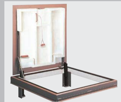
JFR one hour fire door

Bilco UK Ltd. Park Farm Business Centre, Fornham St. Genevieve, Bury St. Edmunds, Suffolk IP28 6TS Tel: 01284 701696 Fax: 01284 702531 Email: bilcok@bilco.com www.bilcok.co.uk