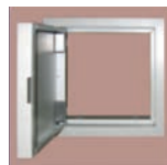
WALL AND CEILING ACCESS