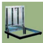
FLOOR ACCESS DOORS