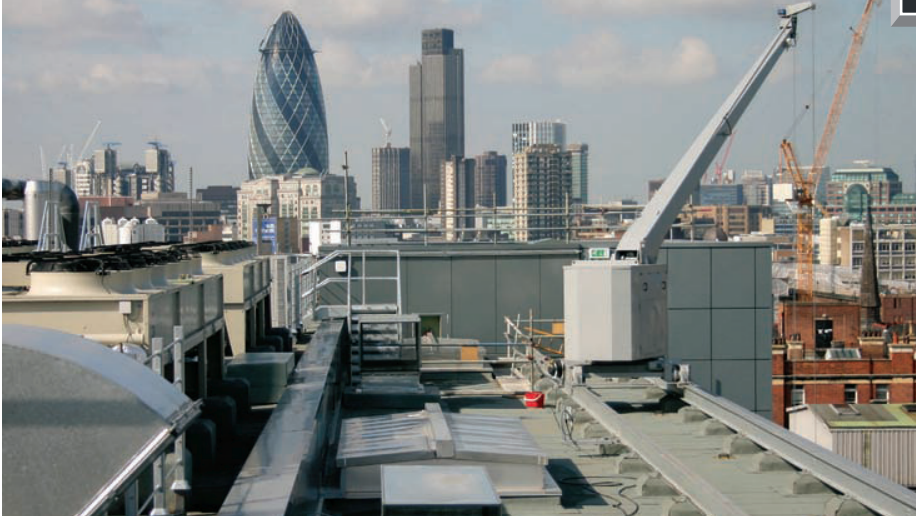
A Bilco Type D-50 aluminum roof access hatch can be seen in the mid-ground on the roof of the new Pathology and Pharmacy building at Barts & London NHS Trust in Whitechapel, London.

Staff working at Barts and The London NHS Trust's new Pathology and Pharmacy building are now finding it easier to move equipment in and out thanks to the installation of roof access hatches.