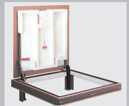
JFR one hour fire door