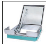
Typical smoke vent